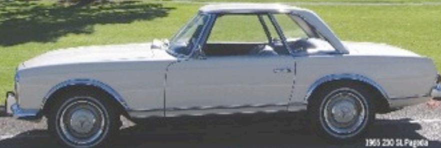
1965 230 SL Pagoda

For details & information, go to www.legendsoftheautobahn.org and click on the MBCA logo or "Mercedes-Benz." Or contact Laura Simonds at 650.592.7613 | simonds@pacbell.net