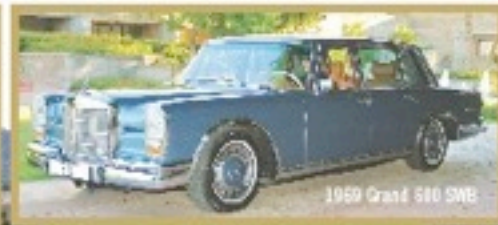
1959 Grand 500 SWB